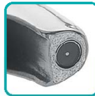
50.000 Pixel Fiber System