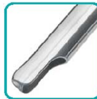
Atraumatic Tip Design