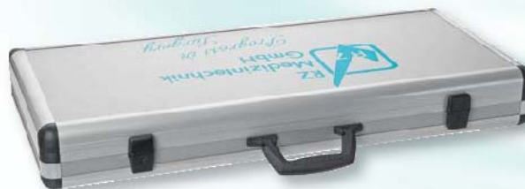
253-900-001 Uretero-Renoscope carrying case