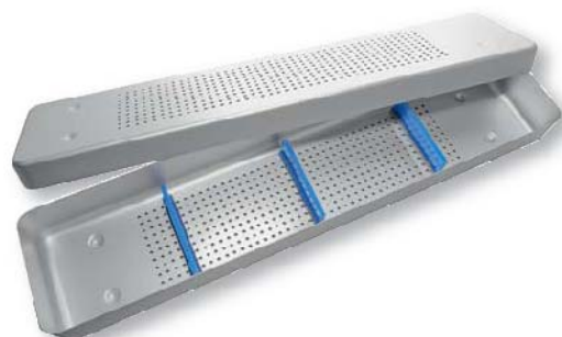
253-905-000 Container for Uretero Renoscope with Silicone insert 640 x 140 x 60mm

All channels allow easy and comfortable insertion. Two ports are available - and each allow insertion of semi-rigid and flexible instruments. Our expertise in Urology guarantees perfect and comfortable function at any time.